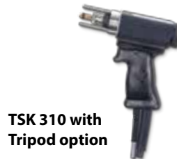
TSK 310 with Tripod option