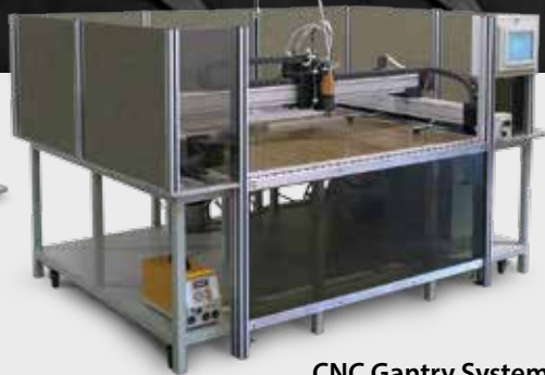
CNC Gantry Systems