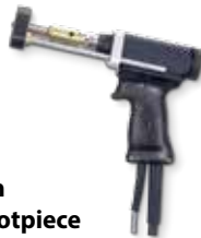
TSK 310 with Standard Footpiece