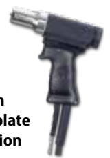
TSK 310 with 30 mm Template Adapter option

Using Genuine Keystone parts and accessories will ensure performance and long term durability.